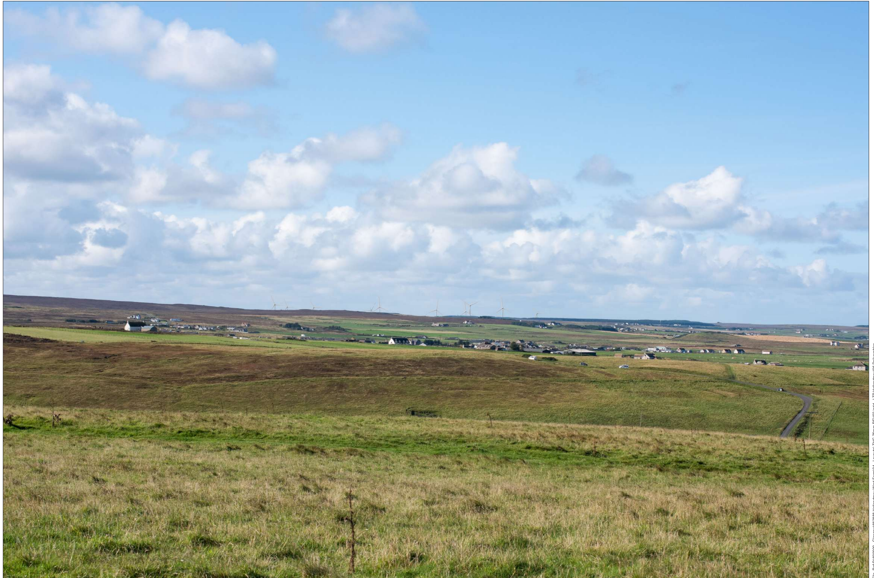
Figure: 7.19-THC-04 Viewpoint 6: Duncansby Head

This image should be viewed at a comfortable arm's length (Approx. 500 mm)