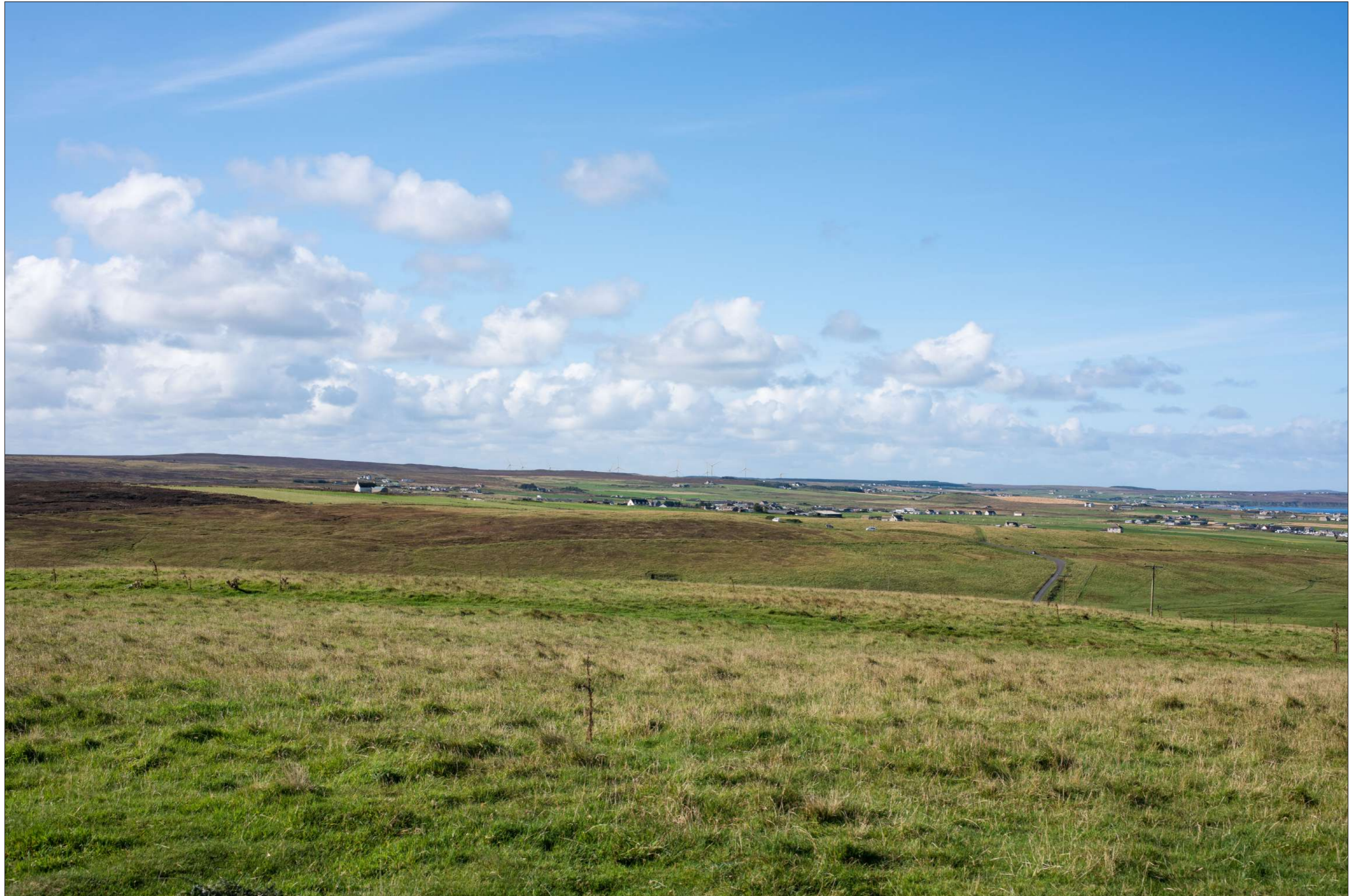
Figure: 7.19-THC-03 Viewpoint 6: Duncansby Head

When viewed at a comfortable arm's length (approx. 500 mm), this printed image is representative of our detailed central vision, but is not representative of scale and distance.